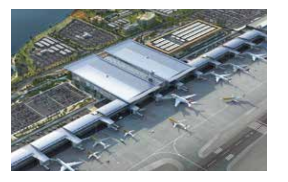
Bahrain International Airport New Passenger Terminal Building, Muharraq / Bahrain

Passenger Terminal Complex of the Hamad International Airport is the biggest construction contract that TAV Construction has been awarded and completed thus far with a total built-up area up to 550,000 square meters.